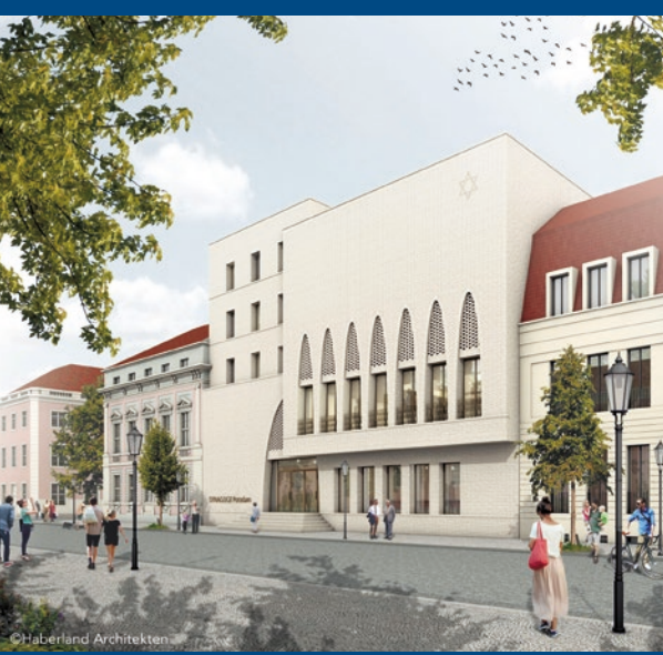
Visualisation of the new synagogue

Construction will start in autumn 2021 and completion is expected in 2023. The Brandenburg State Enterprise for Real Estate and Construction will be responsible for the execution of the construction. In the future, the centre will be open to all Jewish communities in Potsdam for religious services. religious celebrations and gatherings and cultural events as well as for social counselling services and training sessions.