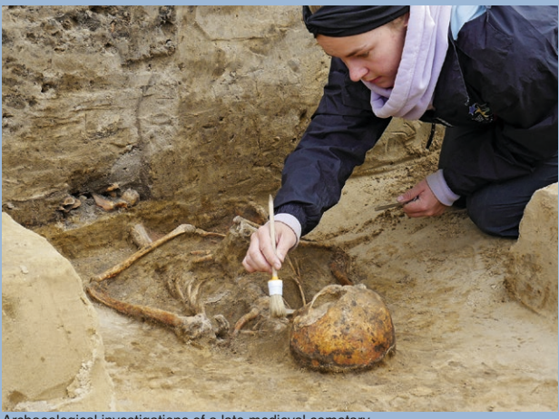
Archaeological investigations of a late medieval cemetary

This area was apparently intended as a place for special burials. The cemetery was reduced in size in the 17th century. The excavation uncovered large boulders of the churchyard wall and the cellars of two residential buildings that had been built on the former grounds of the cemetery. They also found a lot of house inventory in the backfilling of the basement: colourful earthenware and stove tiles with ornamental relief embossing.