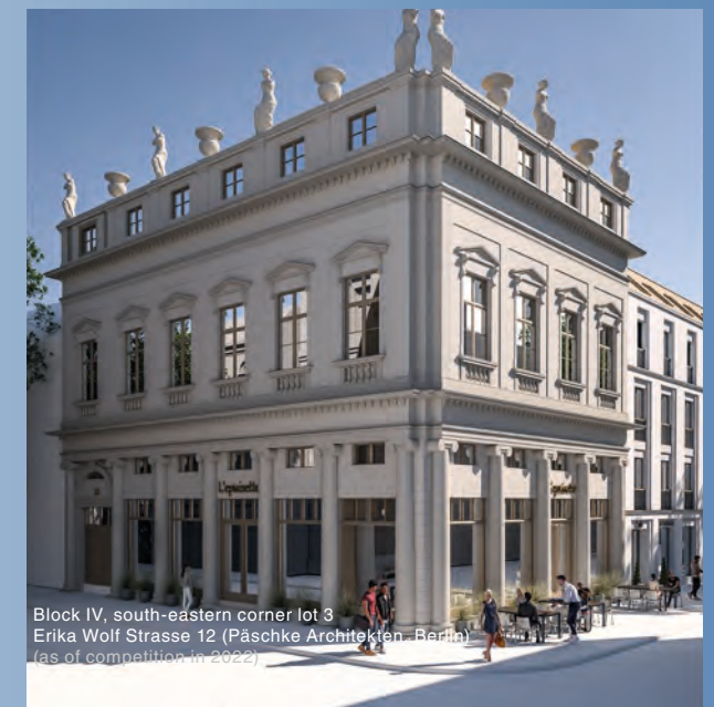
Block IV, south-eastern corner lot 3 Erika Wolf Strasse 12 (Päschke Architekten, Berlin) (as of competition in 2022)

In 2021, the city council confirmed the demolition of the former residential building at Am Alten Markt 10 – colloquially known as the "Staudenhofwohnhaus". The demolition will be completed by mid-2025. An architectural competition for ten new houses in Block V north of Alter Markt is planned for 2025, with construction starting in 2027. ProPotsdam, a municipal housing company, will manage a large part of the apartments and thus contribute further to affordable inner-city living.