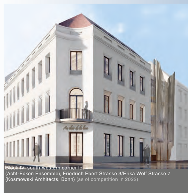
Block IV, south-western corner lot 4 (Acht-Ecken Ensemble), Friedrich Ebert Strasse 3/Erika Wolf Strasse 7 (Kosmowski Architects, Bonn) (as of competition in 2022)

The first commercial tenants moved in in March 2024 and private tenants have been living in the new quarter since July 2024.