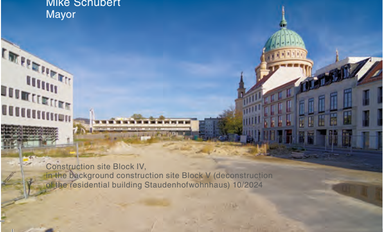
Construction site Block IV, in the background construction site Block V (deconstruction of the residential building Staudenhofwohnhaus) 10/2024