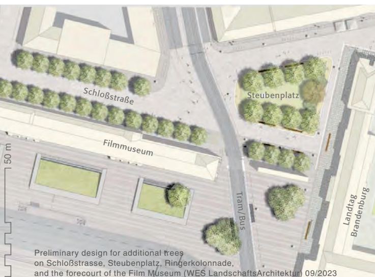
Preliminary design for additional trees on Schloßstrasse, Steubenplatz, Fingerkolonnade, and the forecourt of the Film Museum (WES LandschaftsArchitektur) 09/2023