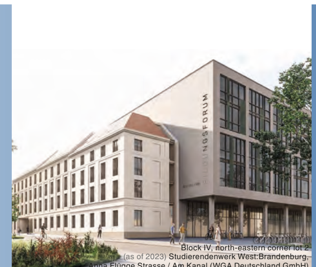
Block IV, north-eastern corner lot 2 (as of 2023) Studierendenwerk West-Brandenburg, Anna Flügge Strasse / Am Kanal (WGA Deutschland GmbH)

Twelve new buildings are being built in Block IV by four developers: Here, too, a mix of rent-controlled and tenant-controlled apartments, a new inner-city student hostel with 80 spots, and commercial units on the ground floor is being built. The building on the corner towards Alter Markt will be given the appearance of the historic predecessor building "Palazzo Barbaran". Construction of the first buildings is scheduled to begin in 2025.