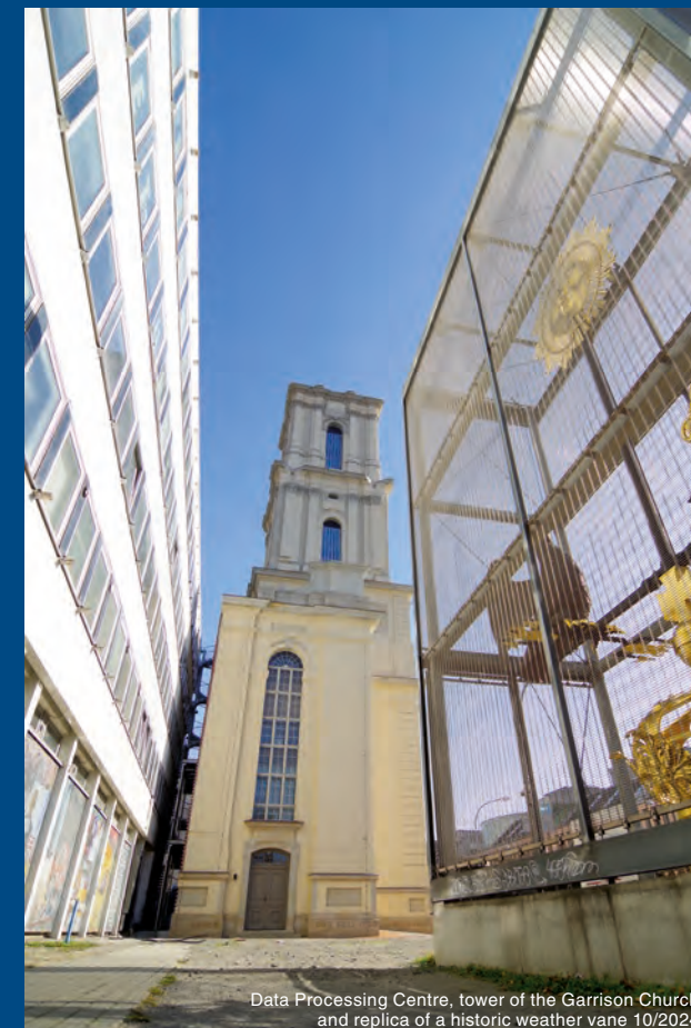
Data Processing Centre, tower of the Garrison Church and replica of a historic weather vane 10/2024

Construction of the tower roof is expected to be completed in spring 2027. The tower roof will then be lifted onto the tower with a crane.