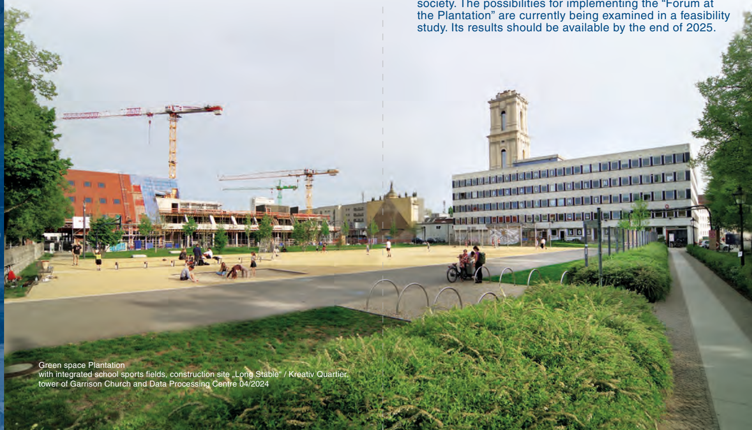
Green space Plantation with integrated school sports fields, construction site „Long Stable“ / Kreativ Quartier, tower of Garrison Church and Data Processing Centre 04/2024

The topping-out ceremony for the final stage of construction on Werner-Seelenbinder-Strasse took place in January 2025. The first buildings are to be ready for occupancy at the end of 2025. The whole Kreativ Quartier will be completed by 2026. Across seven buildings, a total of about 25,000 sqm of rental space will be created, of which 15,000 sqm will be dedicated to the cultural and creative industries and will provide room for innovation and creative work in Potsdam's centre.